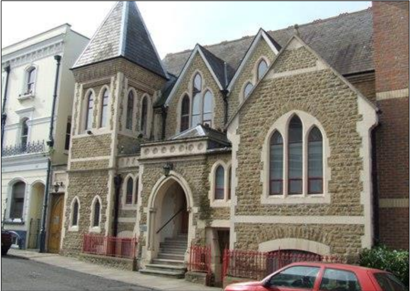
Regent House, Ward Street, Guildford, Surrey GU1 4LH